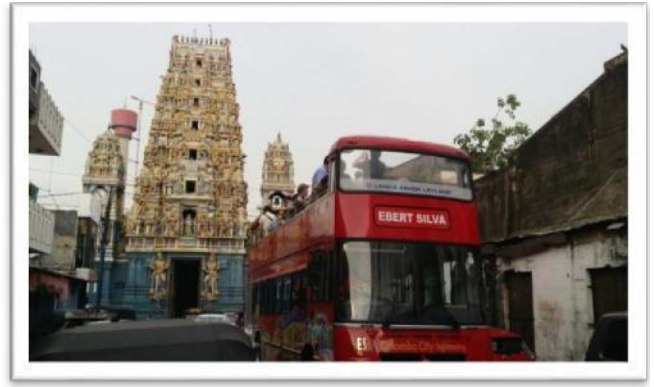
Hindu Kovil with intricately carved gopuram

View the famous Hindu Kovil with a uniquely carved gopuram , the scenic Beira Lake in the heart of the city.