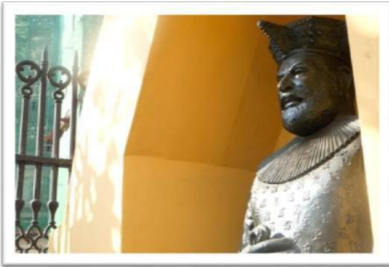
Prison cell of last Sri Lankan king

Pick up guests from venue and travel along the Galle Face promenade with cannons of World War II which is a five hectare ocean-side urban park, stretching half a kilometre along the coast, view the South Expansion of the Colombo Harbor , travel along Chaithya Road to view the Colombo Lighthouse , opened in 1952 by the first Prime Minister of Ceylon Rt. Hon. D. S. Senanayake. Pass Kingsbury hotel, the former Ceylon Continental, the first five star hotel in the island.