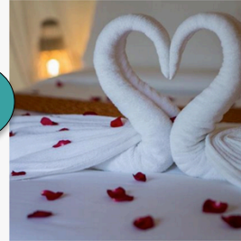
Happy Valentine's Day! #anuraklodge #experiences #love #khaosok #thailand