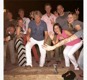
What better way than to end the evening with a campfire party! #anuraklodge #experiences #campfire #khaosok #thailand