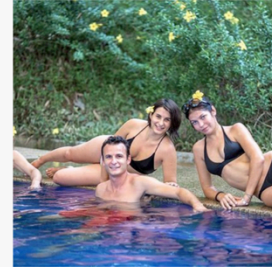
Enjoy a relaxing afternoon at the Romanee Nam Ron hot spring, where you will be surrounded by jungle hills while soaking in the warm healing waters. #anuraklodge #experiences #hotspring #khaosok #nature #jungle #thailand