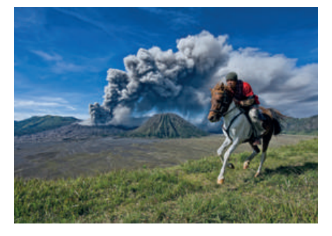
PATATravel Journalism - Travel Photograph Cowboy by Yaman Ibrahim, Mount Bromo, East Java Indonesia Colours Garuda Indonesia Inflight Magazine, August 2014 Agency Fish, Indonesia