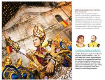
Travel Journalism - Travel Guidebook Best of the Best: Philippines Coffee Table Book Eastgate Publishing Corp. with the support of the Department of Tourism, Philippines