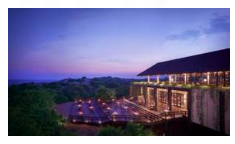
Environment The Success of Self-reliance Jetwing Yala, Yala, Sri Lanka