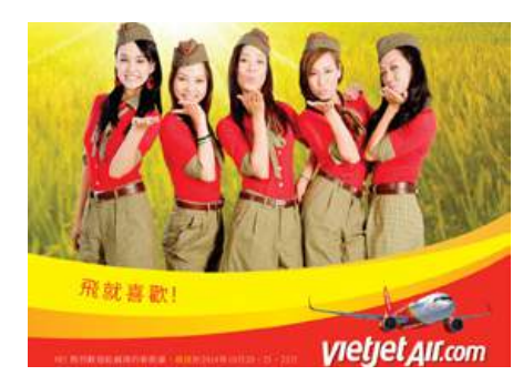
Marketing – Carrier With Vietjet, Saigon is closer Vietjet Air, Vietnam