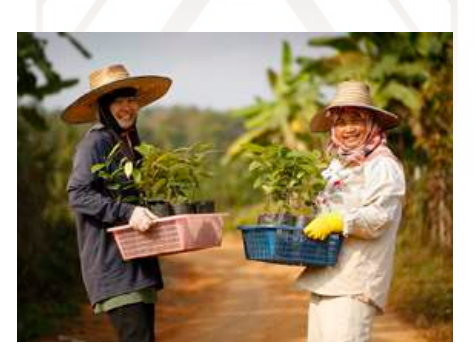
Environment Corporate Environment Programme PLANET 21: Reinventing Hotels, Sustainably Accor Asia-Pacific, Singapore