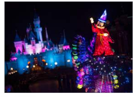
Marketing - Industry Disney Paint the Night Hong Kong International Theme Park Limited, Hong Kong SAR