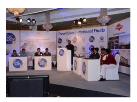
Education and Training Thomas Cook Travel Quest Thomas Cook (India) Ltd., India