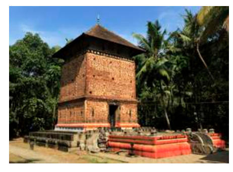
Heritage - Culture - Heritage Muziris Heritage Project Kerala Tourism, India