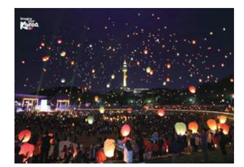
Marketing Media - Travel Advertisement Print Media Korea Tourism Photo Contest Award Winners, 2014 Korea Tourism Organization, Republic of Korea