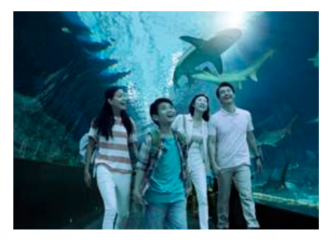
Marketing – Hospitality RWS Moments Campaign Resorts World at Sentosa, Singapore