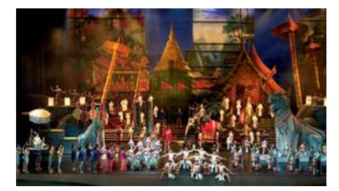
Heritage – Culture SIAM NIRAMIT- Journey to the Enchanted Kingdom of Siam Ratchada Niramit Co., Ltd., Thailand