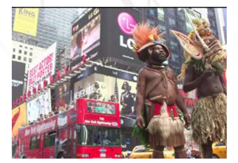
Marketing Media - Public Relations Campaign PNG Pop Up Village Tourism Papua New Guinea + Myriad