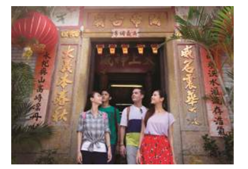
Marketing Primary Government Destination My Time for Hong Kong Hong Kong Tourism Board, Hong Kong SAR