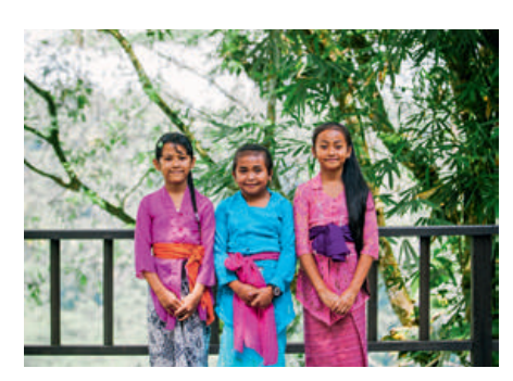
Travel Journalism - Destination Article Transcendence, Travel+Leisure Southeast Asia, July 2014 written by Holly McDonald, photographed by Lauryn Ishak Travel+Leisure Southeast Asia, Thailand