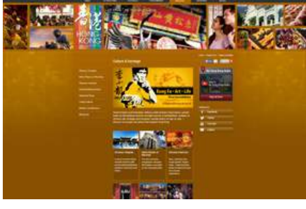
Marketing Media - Web Site DiscoverHongKong.com Brand Rejuvenation Hong Kong Tourism Board, Hong Kong SAR