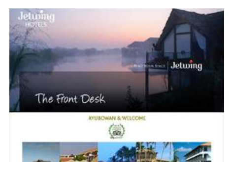
Marketing Media - E-Newsletter The Front Desk Jetwing Hotels Ltd, Sri Lanka