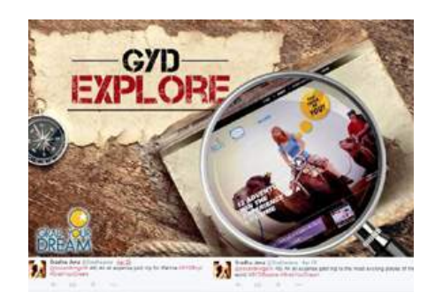
Marketing - Adventure Travel Grab Your Dream Cox and Kings Limited, India