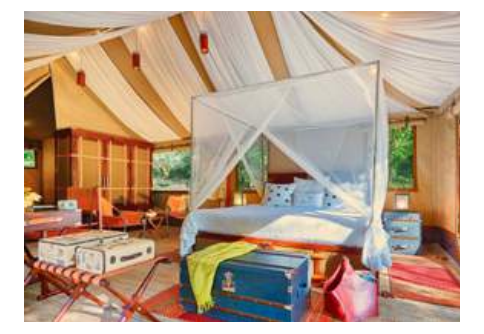
Marketing Media - Consumer Travel Brochure The Ultimate Travelling Camp, India