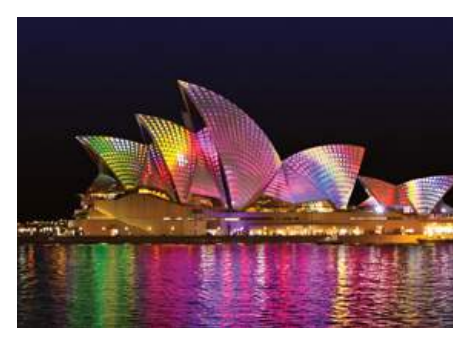
Marketing Secondary Government Destination Vivid Sydney, Destination NSW Sydney, Australia