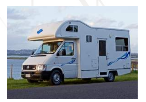
Environment - Ecotourism Project Proactive Roles of Wendekreisen Travel Ltd. Wendekreisen, New Zealand