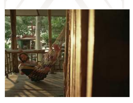
Marketing Media - Social Media I Hate Thailand Tourism Authority of Thailand (TAT), Thailand