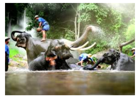
Marketing - Promotional Travel Video Discover Thainess Tourism Authority of Thailand, Thailand